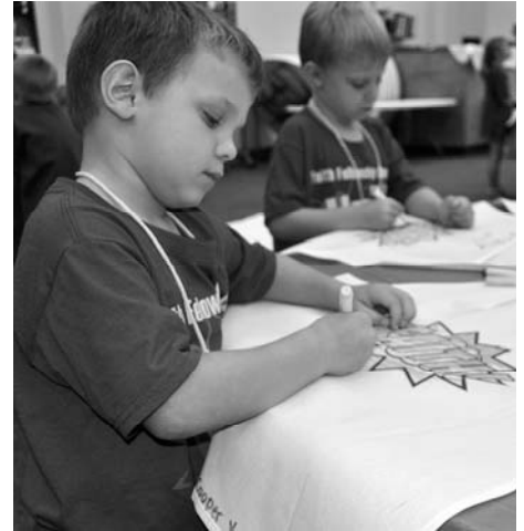
Members of Team Superfriends work on coloring their capes during Tuesday's fun craft time.

Our heroes in training will get to take their capes home with them on Friday during the big Mission Success Celebration that begins at F.A.I.T.H. HQ promptly at a NEW TIME of 6:30 p.m.